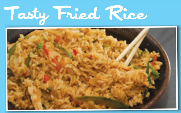
Vegetable $14.75 | Chicken $15.75 Shrimp $17.75

Lasagna Homemade, served with garlic bread, tossed salad or soup $15.75