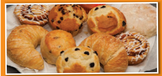
delicious start to the day!

Now offering: raisin, rye, white & whole wheat bread as well as white homemade rolls