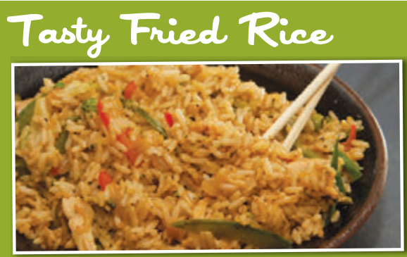
Vegetable $14.75 | Chicken $15.75 Shrimp $17.75

Lasagna Homemade, served with garlic bread, tossed salad or soup $15.75