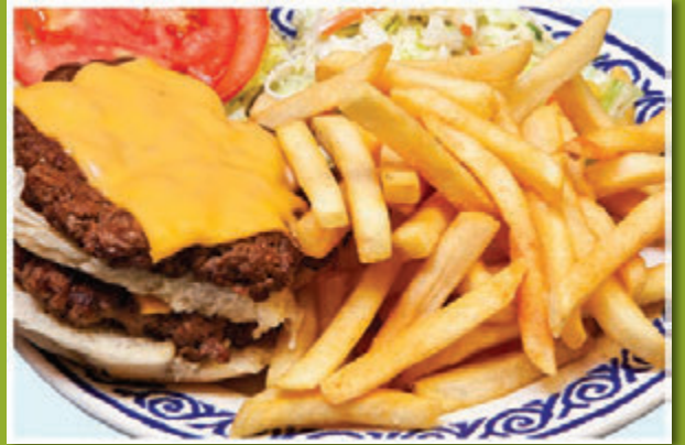
Double Decker Cheeseburger Special