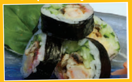
Smoked eel, shrimp tempura, cucumber & fish flakes $12.95